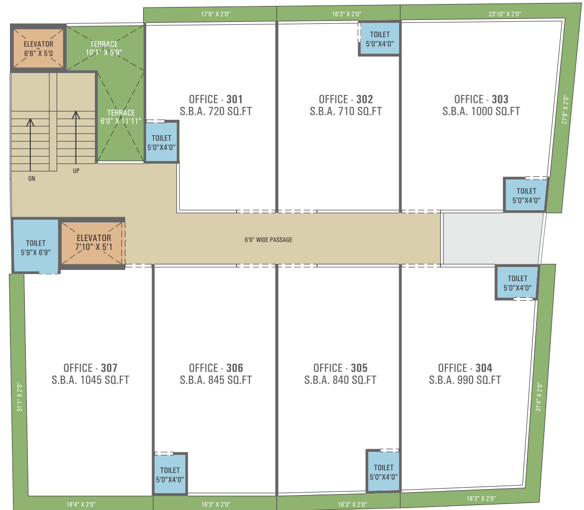
3 rd floor