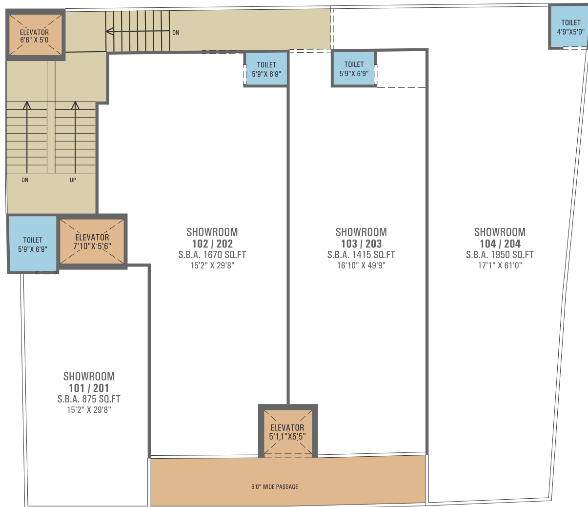
1 st & 2 nd floor